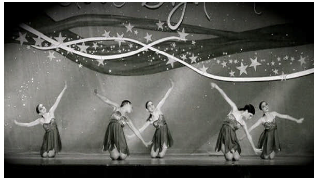
Green & Red Jazz Teams from competition in May 2010